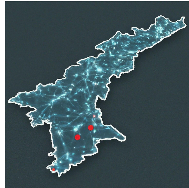
Image: State Map of AndhraPradesh